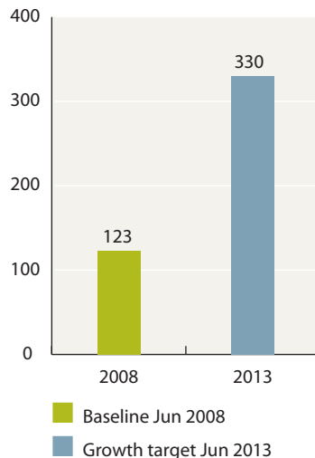
No. of sustainability leaders trained (annual)

Full detailed performance indicators are contained in OzGREEN's Strategic Plan.